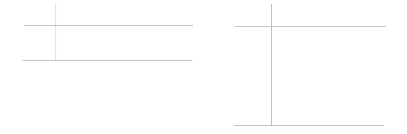
Table 2. Percentage of Jordan ES Teachers who Met Individual and Team SLOs